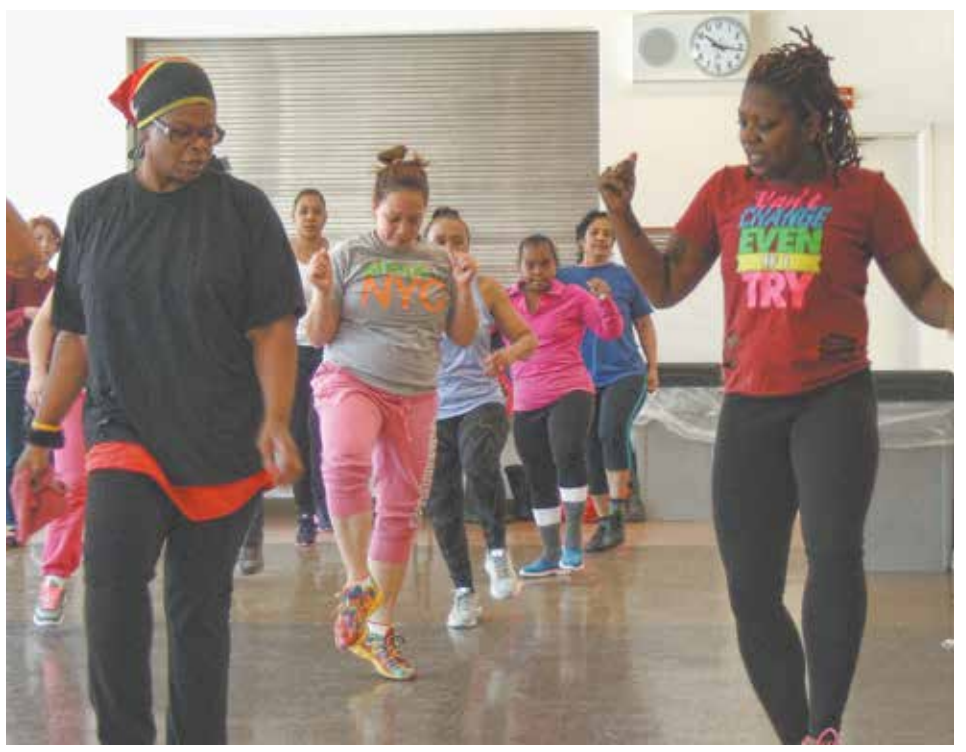
Regular physical activity can help control your weight; reduce your risk of heart disease, diabetes and some cancers; strengthen your bones and muscles; and improve your mental health.