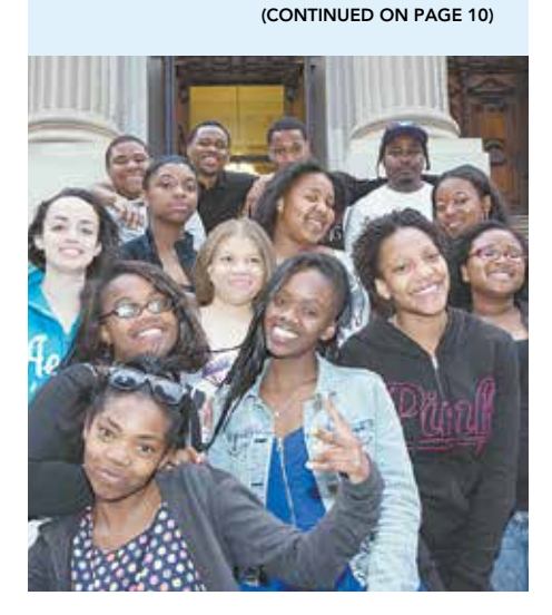
FIND OUT MORE AT WWW.NYC.GOV/NYCHA