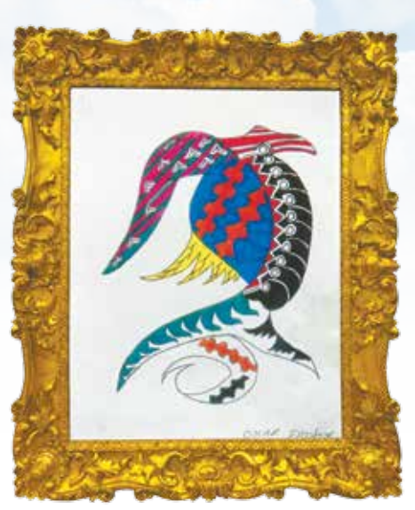
Dragonfly, Oscar Escobar, Citywide, Harbor Terrace, Staten Island