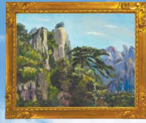
Landscape, Hsia Huf, Citywide, Pomonok, Queens