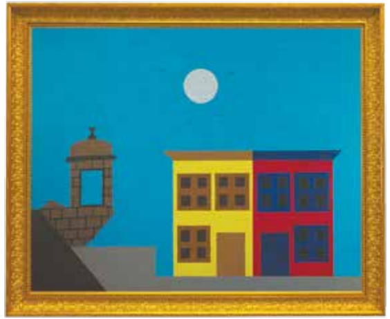
Old San Juan, Puerto Rico, Group 5, Bronx, Bronx River Houses, Citywide