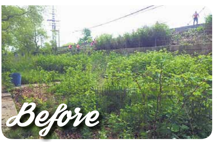
This lot at South Jamaica Houses, which sits next to an LIRR track, was unused for decades. To transform this space into a garden, volunteers had to pull weeds, trim overgrowth, and bag trash.

"Resident requests are made by people who are active in the gardening process