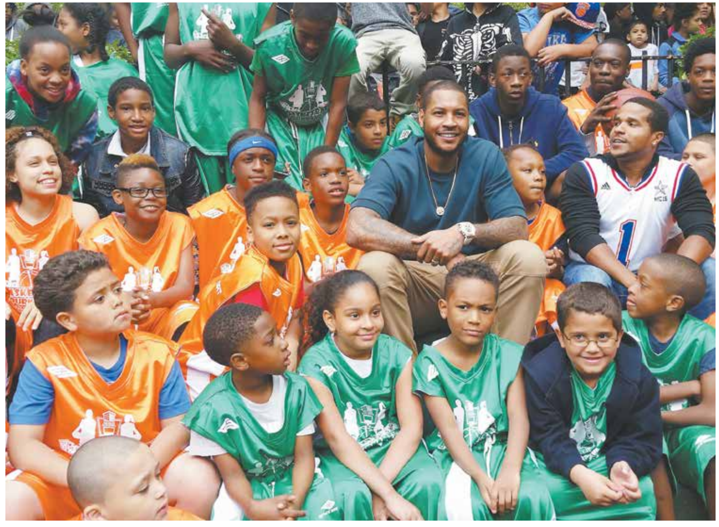
Children from Monroe Houses were excited to meet NBA star Carmelo Anthony at the June 4 ribbon-cutting for a newly renovated basketball court courtesy of Anthony's Courts 4 Kids program.