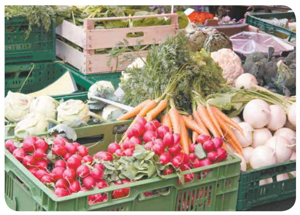
It's summer farmers' market season! Head out to your nearest market to pick up a healthy and colorful selection of fresh food and vegetables straight from the farmers who grew them.