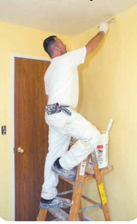
A bright, new paint job at LaGuardia Houses.

MissionMakeover is expected to take five years to complete. LaGuardia Houses and Wyckoff Gardens will be the first two developments to get new paint jobs. Prior to painting the surfaces, NYCHA will make any necessary repairs to them, including plumbing (to prevent mold conditions), plasterwork, and carpentry. Residents will be notified as their building and apartment are scheduled for this work.