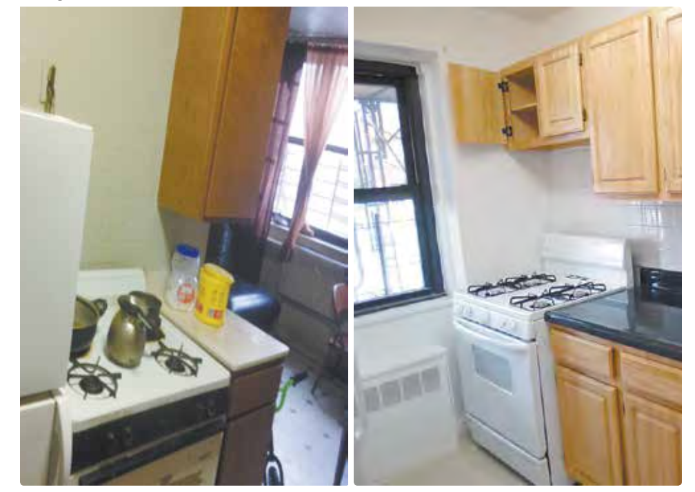
An example of the type of upgrades that may be completed through the RAD program.