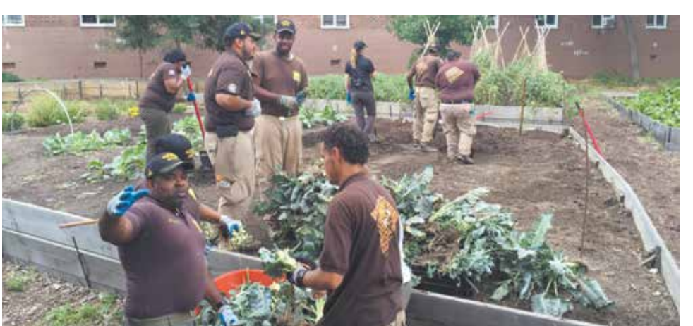
Green City Force's work with NYCHA's urban gardeners and farmers is one of the Sustainability Agenda's strategies.

been downloaded more than 23,000 times and has been used to create over 90,000 work orders. Download the free app from Apple's App Store or Google Play today! MyNYCHA is also available online as a regular webpage, in English and Spanish, here: on.nyc.gov/mynycha.