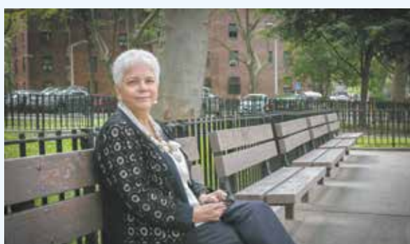
Former Deputy Mayor Ninfa Segarra, back home at La Guardia Houses.