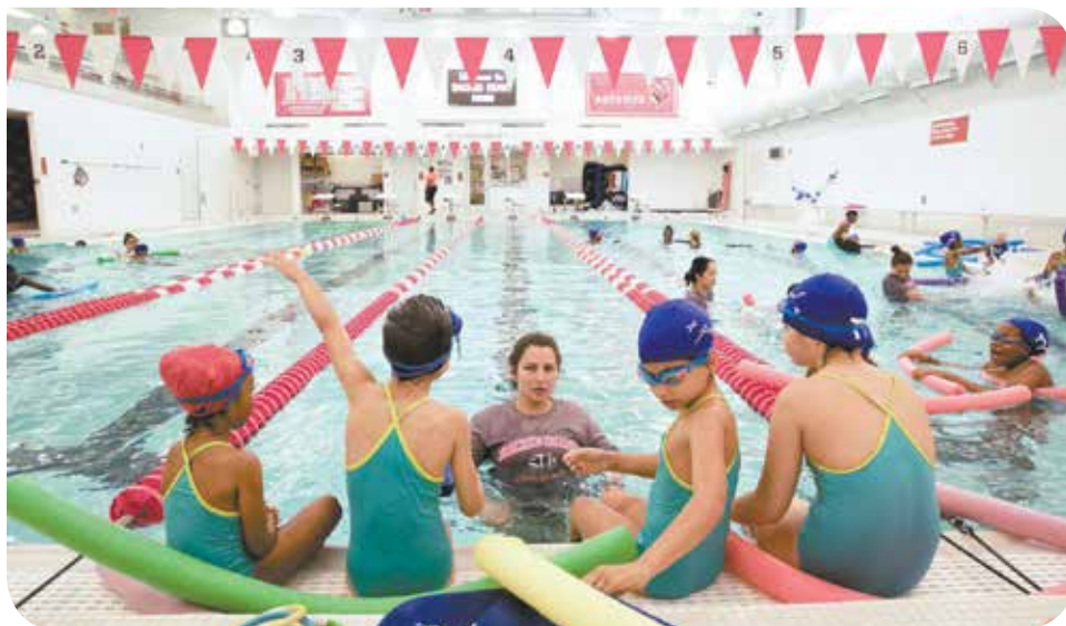
+ POOL Summer Bluefish, 2017.

All participants in the swim program received new swimsuits, swim caps, goggles, towels, T-shirts, and bags. Ten children from last year's class were invited back to train to be lifeguards at the future + POOL water-filtering pool in the East River.