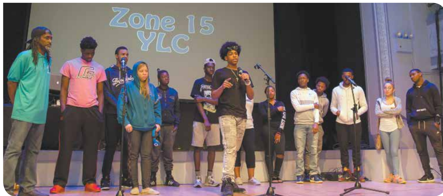
Staten Island YLC members talked about their project to improve communication between their community and the New York City Police Department.