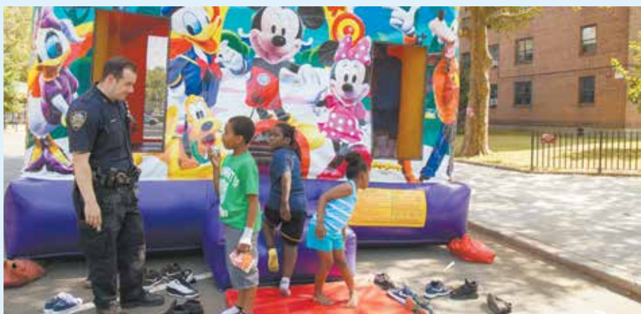
Children wait for their turn in the bouncy house at Sotomayor Houses.